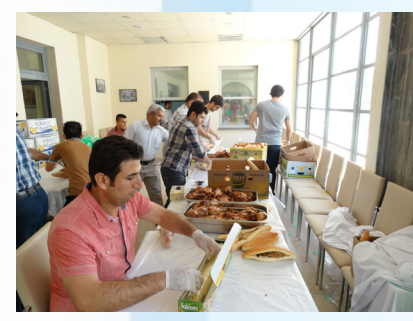
ETTS Staff during packaging meals for IDPs - ETTC Bistro - Erbil