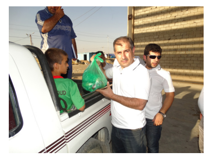
All ETTC Staff involved in the process