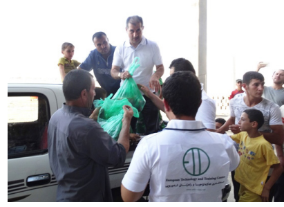
Distibuting food with the workers at the Camp